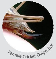
Female Cricket Ovipositor

7 Past Laban, turn right into Copperas Street. On your left is one of the latest high rise developments to be built in the area. New lives, new landscapes. Continue on to Creek Road.