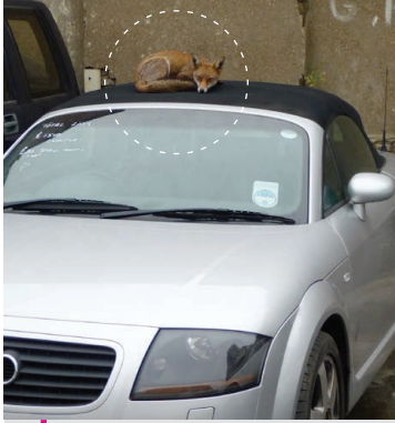
Keep an eye out for foxes